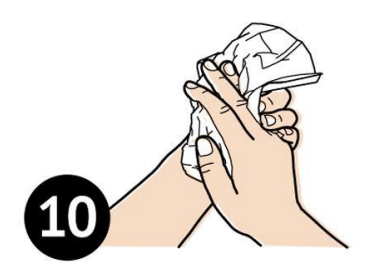
Dry hands thoroughly with a single use towel