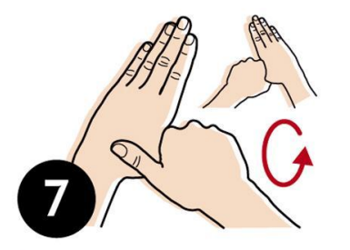
Rotational rubbing of left thumb clasped in right palm and vice versa