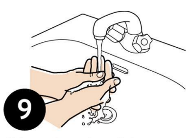
Rinse hands with water