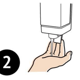
Apply enough soap to cover all hand surfaces