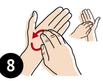
Rotational rubbing, backwards and forwards with clasped fingers of right hand in left palm and vice versa