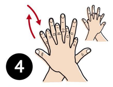
Right palm over left dorsum with interlaced fingers and vice versa