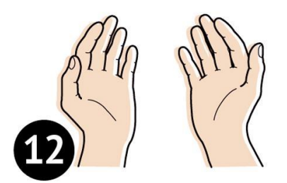
Hands are now safe