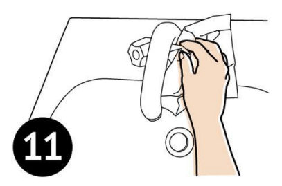
Use towel to turn off tap